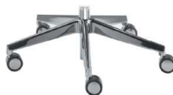
AL5 5-star base in die-cast polished aluminum Ø 654 mm with chromed gaslift