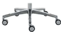
AL3 5-star base in die-cast polished aluminum Ø 654 mm with chromed gaslift