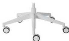
AWW 5 star base in die cast aluminium white painted Ø 654 mm, with WHITE GASLIFT .